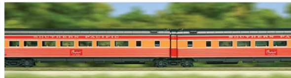
The Observation drumhead matches the neon appearance of the 1:1 scale counterpart, as do the full-width diaphragms.