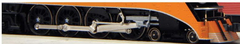
The primary driver bears a traction tire while the others feature sprung axles to maximize grip and connection on uneven track.

The Kato 4-8-4 GS-4 locomotive is a triumph of N scale design, combining sophisticated modern engineering techniques and old-school styling. With an innovative sprung suspension, fully functional metal siderods, and a powerful Kato drive, the GS-4 can pull an 18+ car consist up a 4% grade, unassisted.