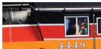
N scale figures (Item 24-270) fit easily in the engineer's cab.

The GS-4 and "Morning Daylight" have been hailed as the "most beautiful train in America" and Kato has gone to great lengths to capture that essence in N scale.